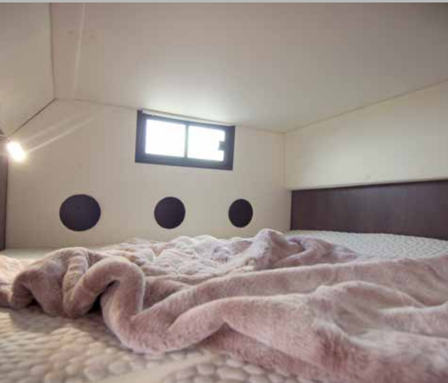
Beautiful living, bright, airy and spacious