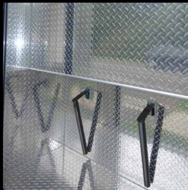
Slimline tack lockers in horse area designed to maximise space for saddles