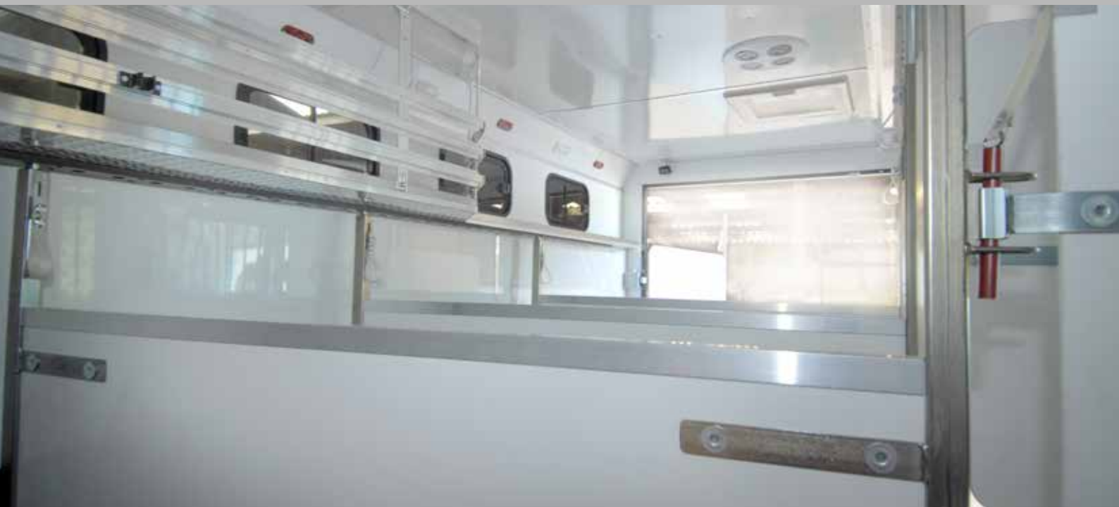
Large, clean, bright and spacious horse area