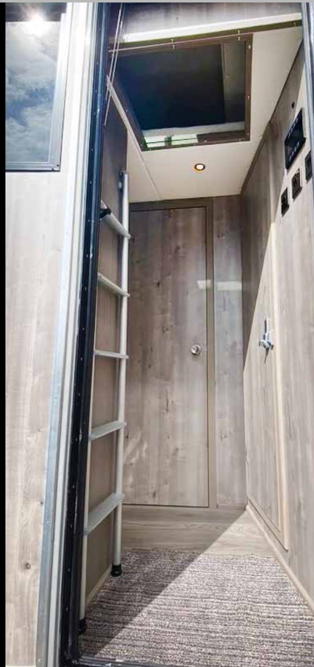
Large modern bathroom with plenty of storage